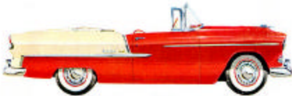
THE BEL AIR CONVERTIBLE