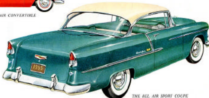
THE BEL AIR SPORT COUPE