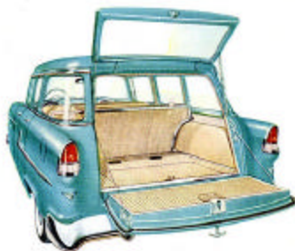
THE BEL AIR 4-DOOR STATION WAGON