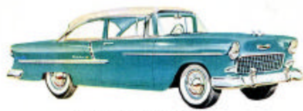
THE BEL AIR 2-DOOR SEDAN